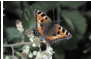
Surrounded by wildlife